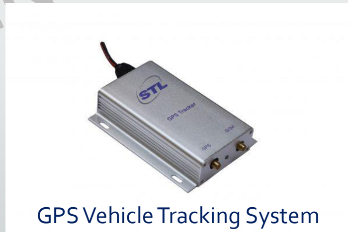
GPS Vehicle Tracking System