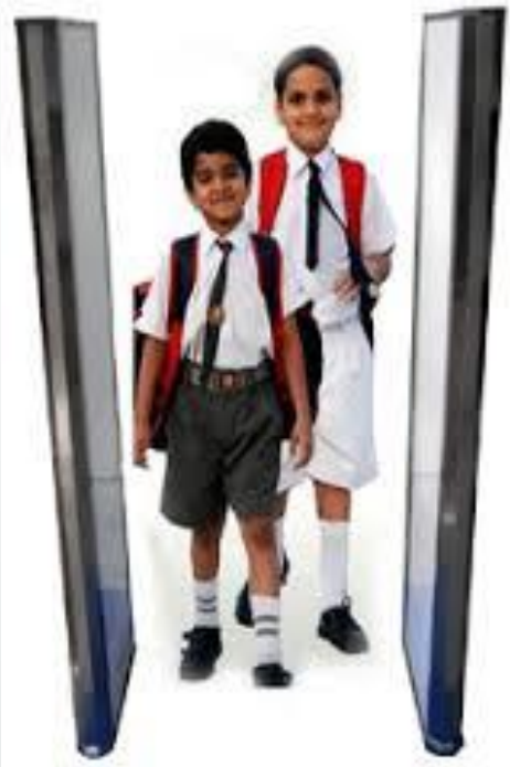
Wireless Walk – In RFID Reader

Below products can be integrated with our BATS. For details, kindly reach us at sales@indigns.com