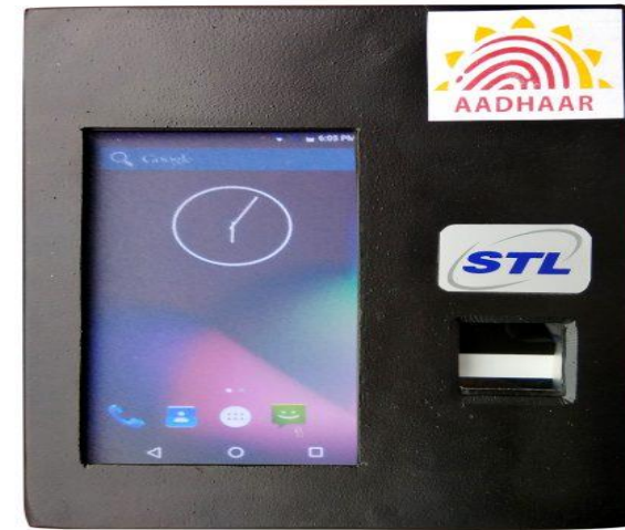
Wireless AADHAAR Biometric System