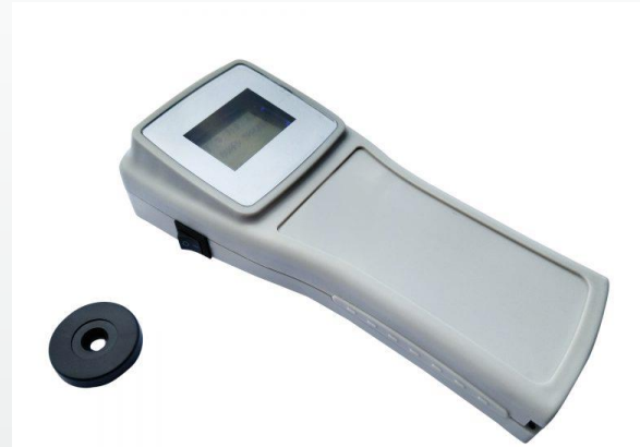
Wireless Guard Monitoring System